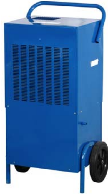
ELECTRONIC PANEL CONTROL